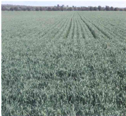
Global reserves of cereal crops, including barley, have fallen to their lowest levels for 30 years.

cally demanding. They require new ways of doing science within rural communities facing radical environmental, social and economic changes.