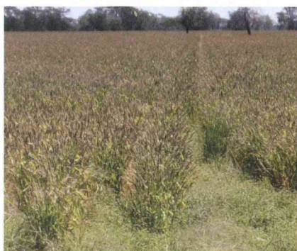
Millet sown into native pasture, helps to integrate productivity with the ecological processes of the landscape.

organisational capacity and the right policies are still required or we take two steps forward and one step back. Governments need to adopt policies that create incentives for sustainable practices and internalise costs to the environment.