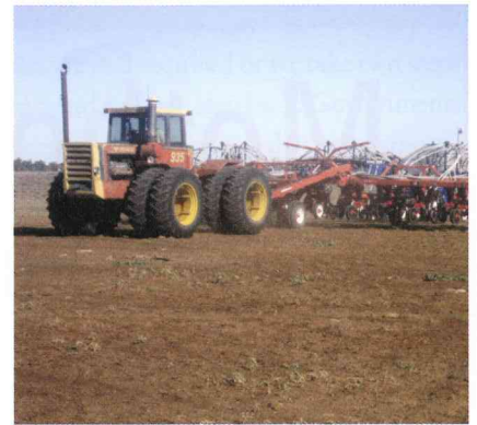
Agriculture is not just about putting things in the ground and harvesting them.

Now is not the time for Australia to turn its back on the rest of the world and allow its investment and international commitment in agricultural science to