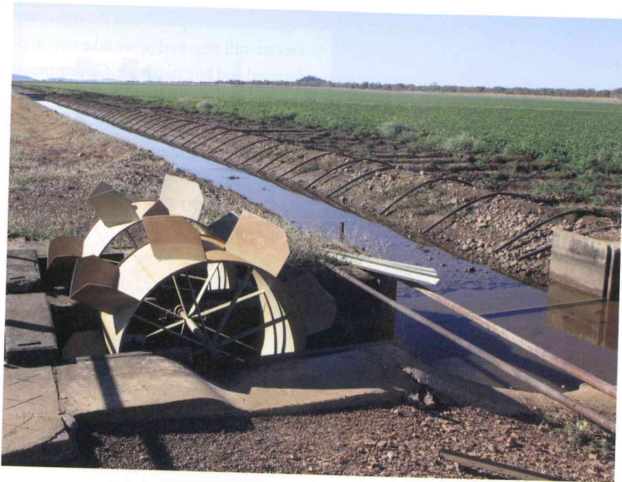
Food production under irrigation faces increasing competition for water as more water will need to be returned to damaged rivers and estuaries and climate change threatens declining snow and rainfall in river catchments.