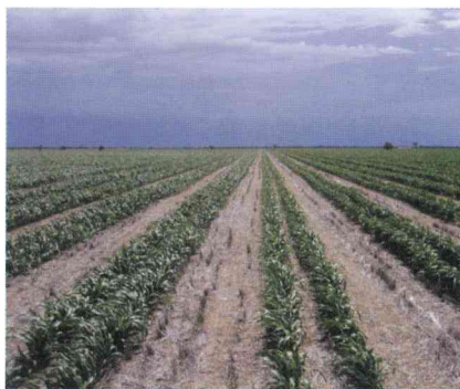
Sorghum established with minimum tillage and a trash blanket is an example of improved farming practice to cope with climate variability and improve soil health. Development like this is needed to increase food security and reduce damage to the environment.

How, then, do we achieve the seemingly unachievable? How do we increase agricultural productivity and yet protect the natural assets that will underpin