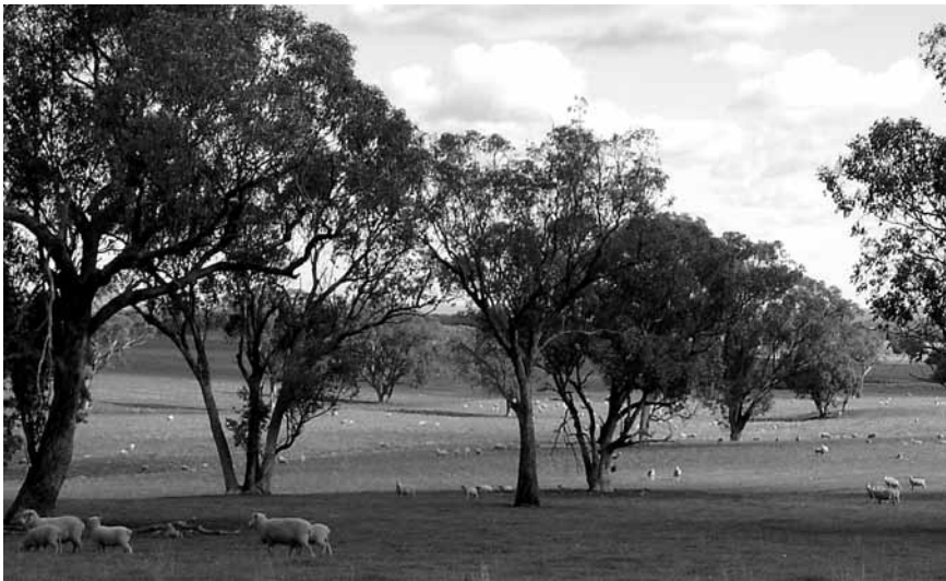
Figure 8.1 Mixed Farm in Central West NSW – A Relic of the Past?

Agriculture in many developed countries has undergone a transformation – becoming both increasingly intensified and specialised. Accompanying this trend has been a decrease in mixed farming systems and the ongoing substitution of labour for capital. This chapter explores these trends in the Australian context where many competing forces are shaping the agricultural landscape. While recognising that economic, technological and food security factors are key forces, the chapter focuses on the role of knowledge intensity as a driver of farmers' decisions to specialise in both commodity production and land use. The growing knowledge intensity of agriculture, accompanied by a concentration in human capital, is putting increased pressure on farm managers to maximise investments