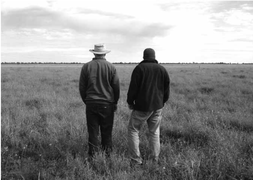
Figure 8.3 Shared Decisions are Important in Farm Management

other neighbouring farmers to jointly employ a skilled farmhand, told how his neighbour was having problems with hiring, particularly at peak times like crop planting: