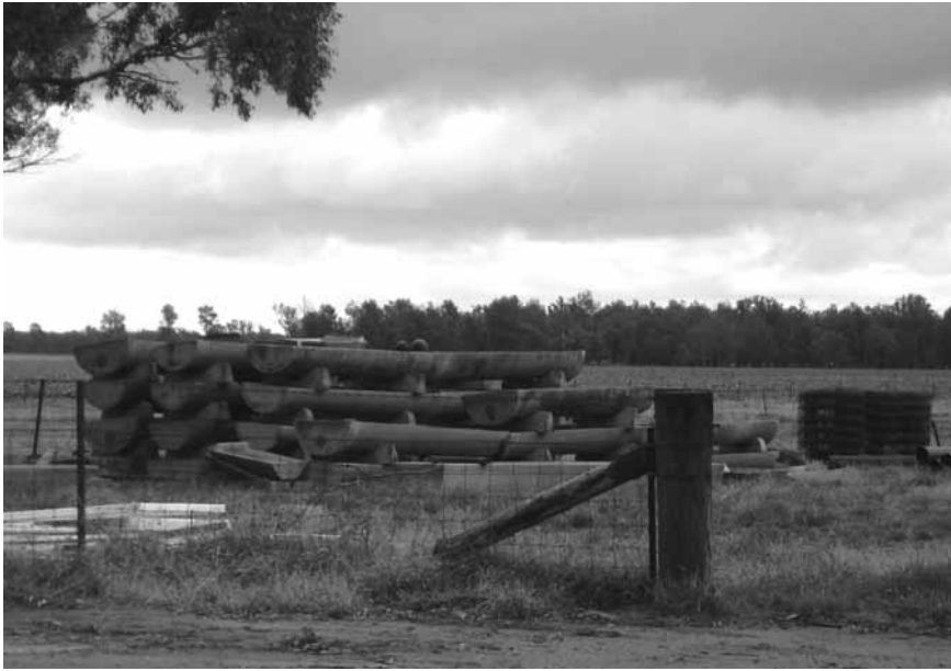
Figure 8.4 A Stockpile of Water Troughs and Fencing Materials – Removed after a Switch from Mixed Farming to Cropping

farmers who had switched to cropping had already removed fences, water troughs and even shearing sheds and sheep yards.